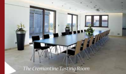
The Crémantine Tasting Room