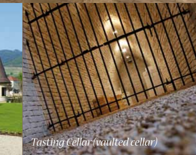
Tasting Cellar (vaulted cellar)