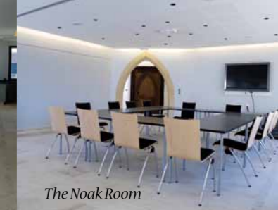
The Noak Room