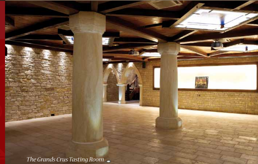
The Grands Crus Tasting Room